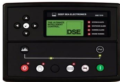
DSE7320 MKII AUTO START & AUTO MAINS FAILURE CONTROL

Fuel and start outputs, configurable when using CAN 8 configurable DC outputs 9configurable analogue/digital inputs Automatically transfers between mains (utility) and generator (DSE7320 MKII only) Increased input and output expansion capability via DSENet® IP65 rating (with optional gasket) offers increased resistance to water ingress DIGITAL INPUTS ANALOGUE INPUT