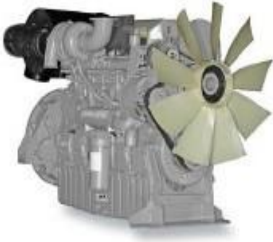
Perkins heavy duty high performance industrial type diesel engine.